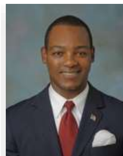
Al Jacquet Deputy Vice Mayor City of Delray Beach